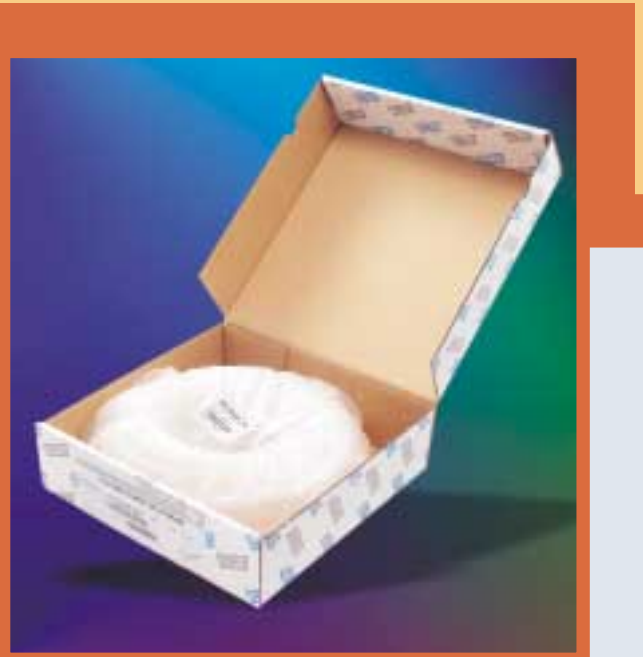
Double bagging is available as an option.