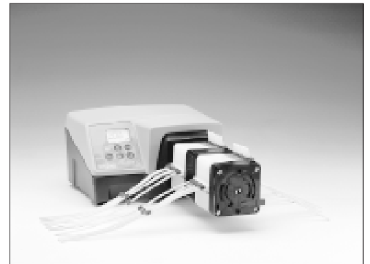
323U/MC8 + 318MCX